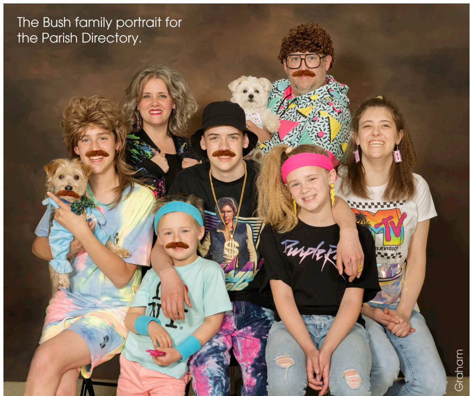
The Bush family portrait for the Parish Directory.

To view photos of the action figures, visit almightylegends.com . †